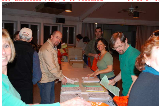
FARC's Wednesday, March 17, 2010 pre-ST. PADDY'S DAY 10-MILE & 5 K RACE PACKET STUFFING CLUB MEETING , a.k.a. the FARC do-si-do was held once

again at Tighe Park off Georgia Road in Freehold Twp., after all those who wanted to enjoy a fun run before the meeting—the usual loop through the park & surrounding neighborhoods. Attendees relaxed while stuffing bags. The meeting also featured announcements on upcoming races. This meeting (see picture above), traditionally includes delicious Irish Soda Bread and Irish Music!